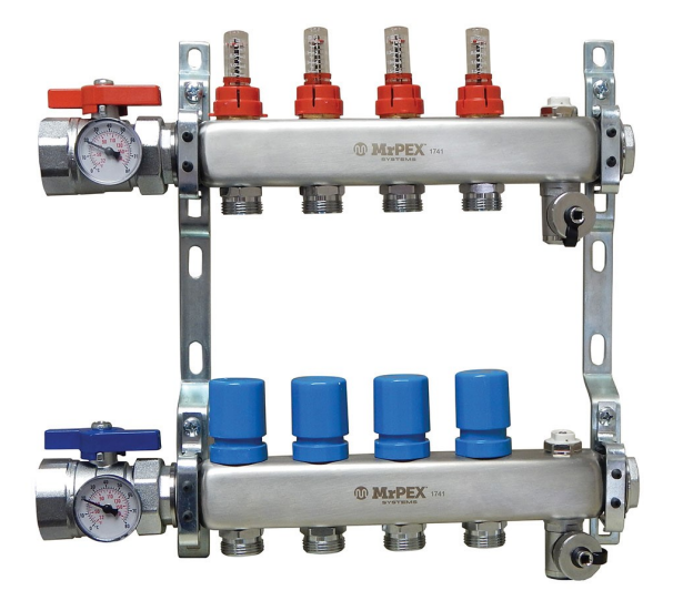
*Shipped as shown

The SUPPLY (upper) manifold is fitted with balancing flowmeters with readable range of 0 to 2 GPM that allow flow adjustment of each individual loop. The flow meters have a brass body and the sight glass is made from temperature and impact resistant plastic, all components are antifreeze resistant up to a 50% mix.