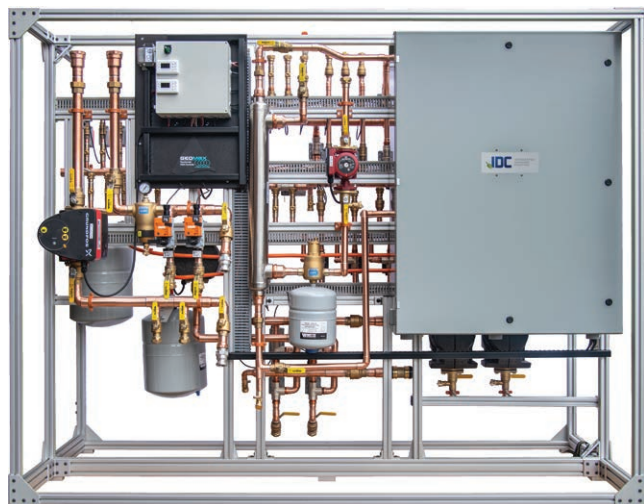
BACK OF FRAMESET